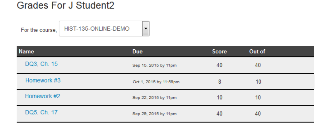
Assignment name, due date, points awarded, points possible

A list of your assignments appears. Each row shows a different assignment, its due date, number of points awarded, and number of points possible.